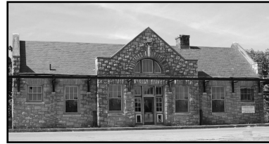
Wernersville Train Station currently undergoing restoration by the Heidelberg Heritage Society

Museum & Library open by appointment call 610-678-6202